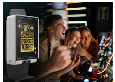
Entertainment and corporate branding