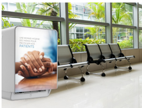
Healthcare wellbeing and hygiene compliance