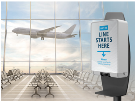
Hand hygiene messaging in high traffic venues

To order custom faceplates for your ICON™ hand towel or skincare dispensers please ask your Kimberly-Clark representative for an order form and artwork templates.