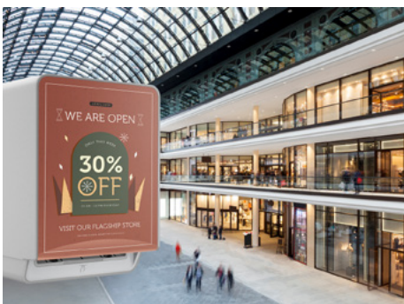
Retail and food service promotions