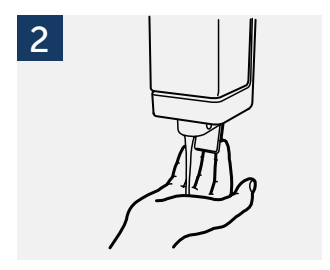
Apply enough soap to cover all hand surfaces