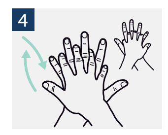
Right palm over left dorsum with interlaced fingers and vice versa