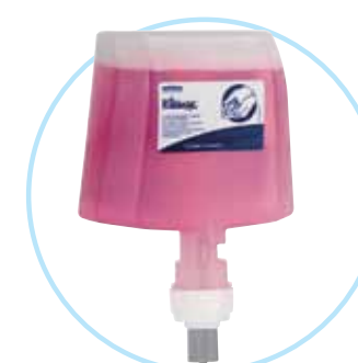
High capacity 1200 mL cassette refills