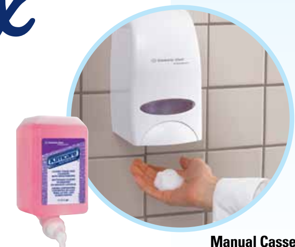
Manual Cassette Skin Care System