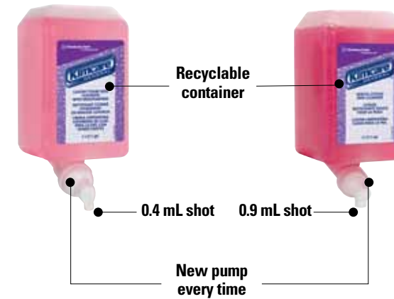
LOTION SKIN CARE REFILL