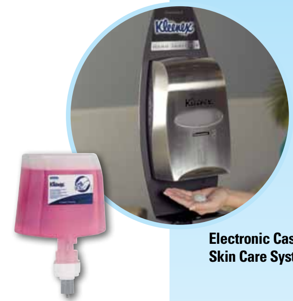
Electronic Cassette Skin Care System