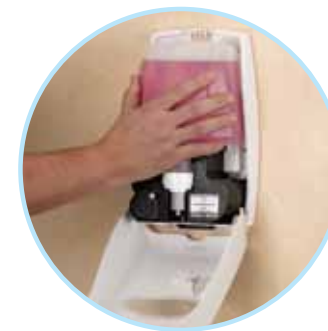
Easy to load Cassette simply clicks into place