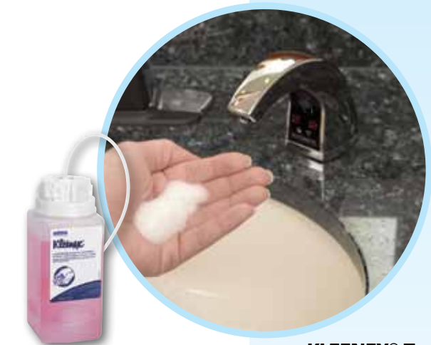
KLEENEX® Touchless Counter Mount Skin Care System