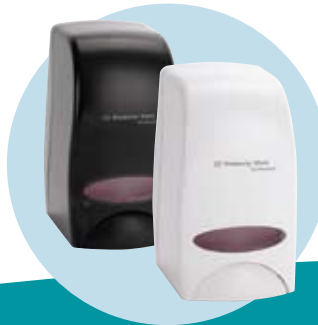
Available in White or Black/Grey