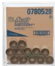
SCOTT® Coreless JRT® Tissue has 37% less packaging waste vs. SCOTT® JRT® Tissue with core. 2