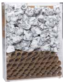
SCOTT® Coreless Standard Roll Bathroom Tissue has 54.6% less packaging waste vs. standard roll tissue. 1

Compare the waste produced by just one case of a commodity-format product to distinctive coreless tissue systems from Kimberly-Clark Professional.